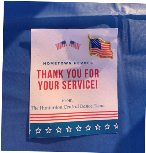
Card and pin given out at Hunterdon Central's "Honoring Our Heroes" event